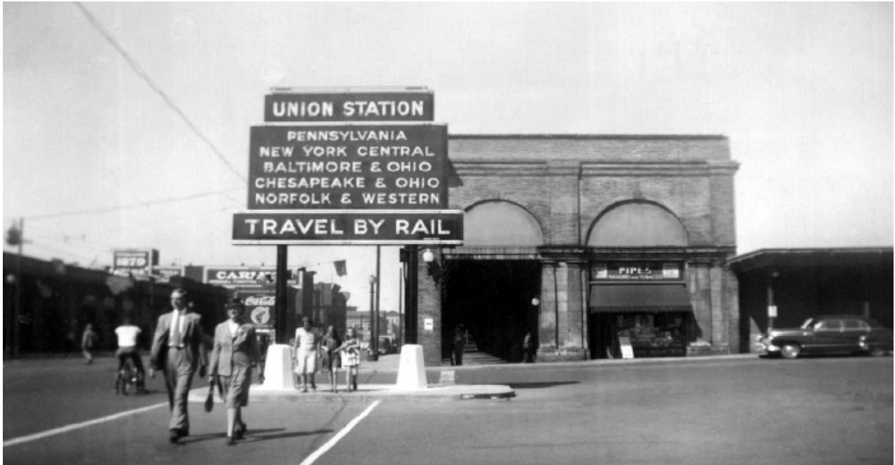
Photo taken in the late 1940's or early 1950's

I remember riding on High Street past Columbus Union Station in the 1950's and seeing the Union Station sign. It always made me want to take a train ride. The camera is looking north with High Street on the left, the Union Station Arcade straight ahead and the actual station off camera to the right about 500 feet. At the far end of the arcade walkway was the Columbus "O" Gauge Model Railroad Club. The tobacco/newspaper store, facing the camera, occupied the space that was the Columbus Railway Power & Light Co. waiting room when the arcade was built in 1897.